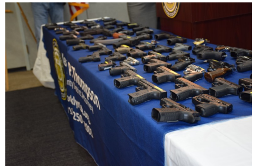
Investigation by DA Thompson's Office found 153 firearms that were smuggled aboard Delta flights

The case is a shining example of how a local law enforcement objective – in this case ending gun violence in Brooklyn by stopping illegal smugglers – can have policy ramifications that improve the safety of all Americans.