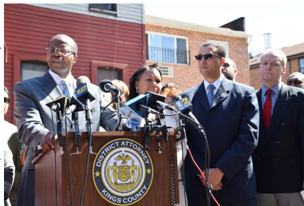
DA Thompson announces the arrest of dishonest landlords in Bushwick

They also affirmed the DA’s determination to prevent any unlawful abuse of Brooklyn’s lucrative real estate market.