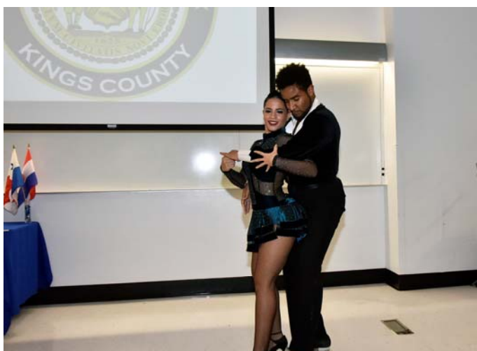
Dancers entertain the crowd at the Brooklyn DA's Office celebration of Hispanic Heritage Month