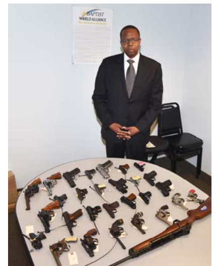
Some of the guns that were turned in at Buyback event

This was the first Gun Buyback event under DA Thompson. In three Begin Again events during 2015, a total of 2,400 people were helped and over 1,600 warrants were vacated. More of these important community-based programs are planned for this year.