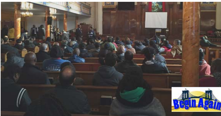
Addressing Begin Again participants inside the church

A Gun Buyback, held in partnership with the NYPD at Lenox Road Baptist Church in East Flatbush, resulted in 60 guns being turned in. Nearly all of them were the types used to commit crimes – revolvers, semi-automatic pistols and even homemade zip guns. Participants received $200 for each operable gun, no questions asked. Some of them volunteered that shootings and gun violence in their neighborhood and across the nation prompted them to attend