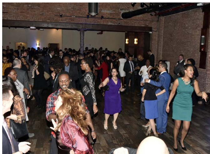
KCDA staffers enjoying the Office's holiday party